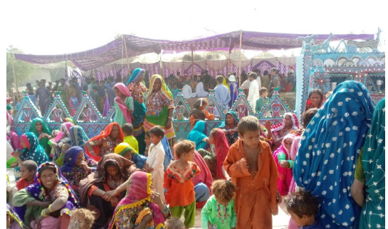
Views of mela festival held on Sunday 4 December.