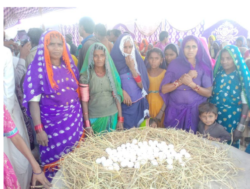
c Views of mela festival held on Sunday 4 December.