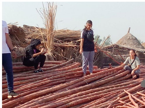
Volunteers examining the bamboo stack.