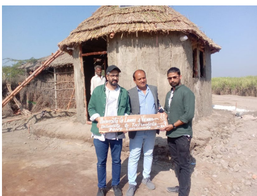
School room co-built by students and community.