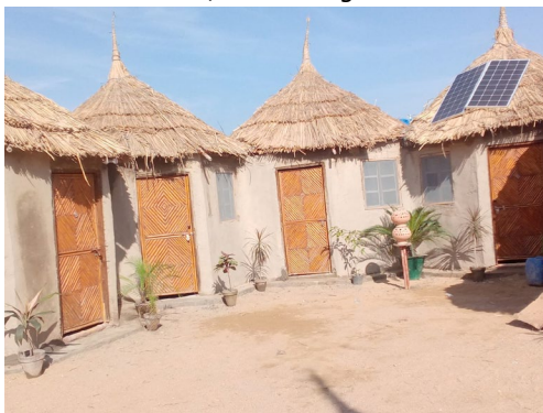
Climate volunteers accommodation.