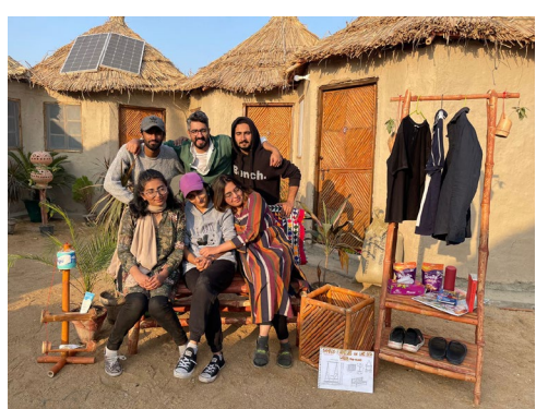
Volunteers with their furniture design.