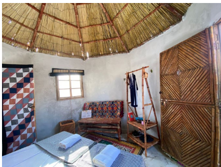
Room with new clothes stand & seat.