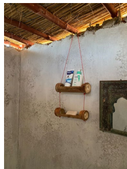
Bathroom with shelves