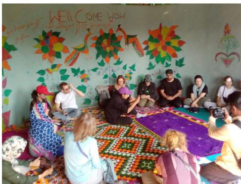
Climate volunteers meeting at Women's Centre, Pono village.

The two teams worked jointly on various aspects. While they conducted research on various aspects, they also built a school room in collaboration with the community, designed some interesting bamboo furniture for the guest cottages, and also participated in a festival that had been arranged to market barefoot goods to surrounding communities and indeed among the 13 villages themselves.