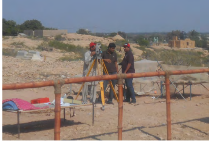
Survey being conducted with total station on site