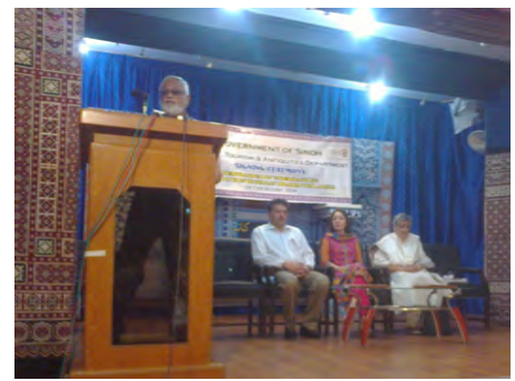
Welcome speech by Director, Archaeoloogy

The names of Technical Consultative Committee members were finalized for consulation and involvement at various stages of work.