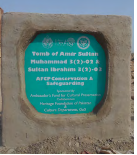
Signage: Tomb of Sultan Ibrahim & Amir Sultan