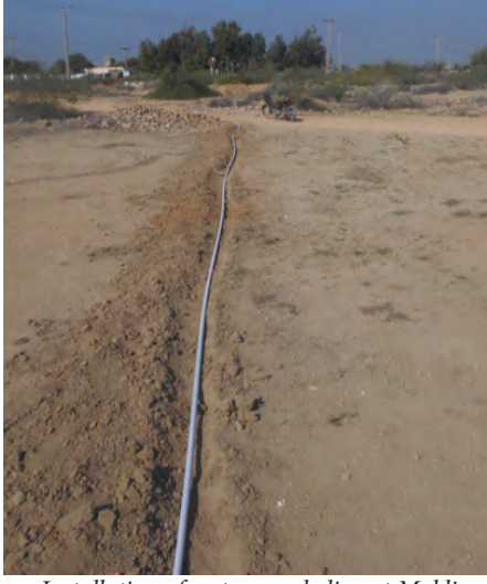
Installation of water supply line at Makli