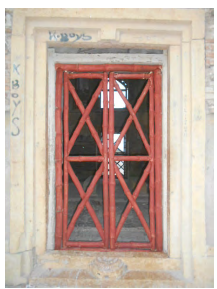
Blocked opening with bamboo door

All openings have been blocked to restrict entry to avoid damage by visitors. Since the work is proceeding, it is important that un-authorise persons should not enter which can be cause of dmaage. Additionally, all opening were also closed with a metallic netting to keep out various pests i.e. squirrels and birds that were currently occupying and damaging internal walls of the main tomb. Since there are bird nests which are a cause of pollution as well as dmage to the fragile surfaces carrying stone carved interlacemets, freso decoration and stucco work.