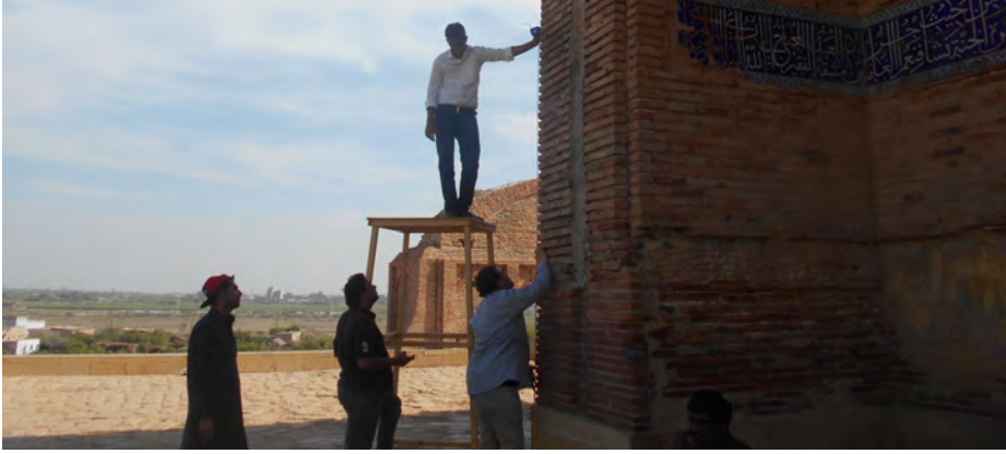
Physical Survey being undertaken at Sultan Ibrahim