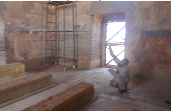
HF personnel undertaking Photogrammetric Documentation