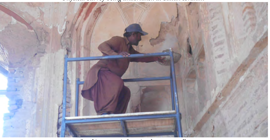
Smoking wasp infestation between walls