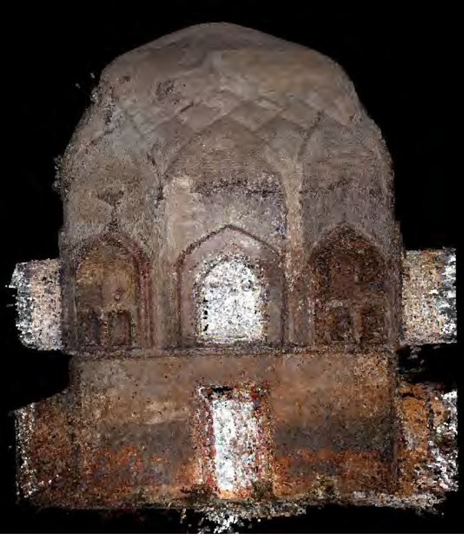
Internal view being developed for Photogrammetric Documentation