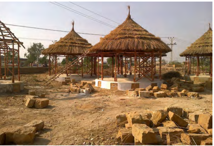
Artisan Clusters nearing completion at Makli