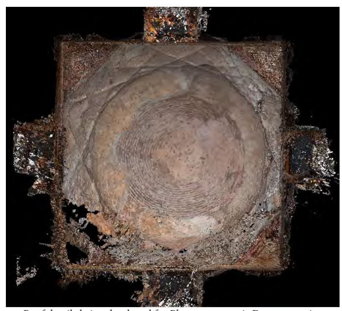
Roof details being developed for Photogrammetric Documentation