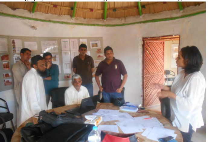
Discussion with Osmani & Co. at Makli on physical survey drawings