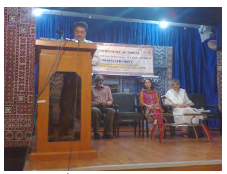
Secretary Culture Department at MoU signing