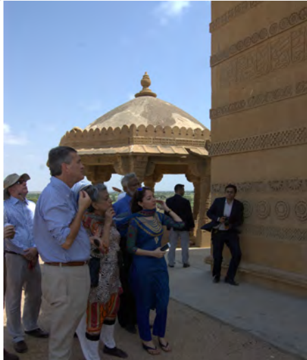
Delegation at Tomb of Jam Nizam al-Din