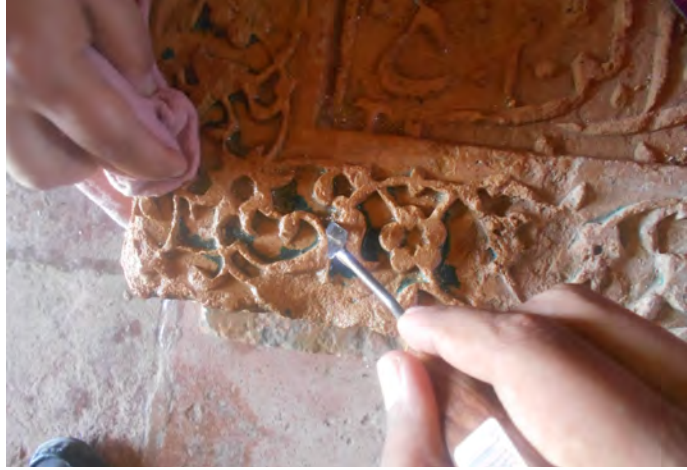
Removing tough enamel paint from groves between stone carving