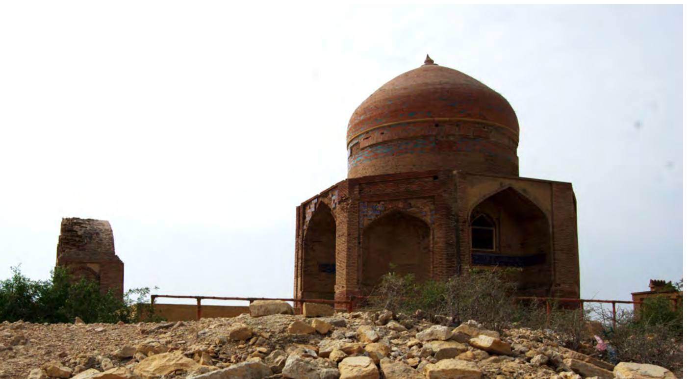
Construction of Boundary fencing at Tombs of Sultan Ibrahim and Amir Sultan Muhammad.