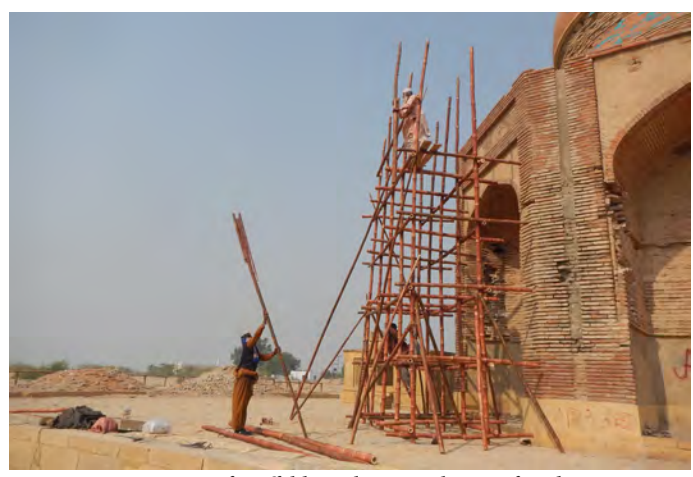
Erection of scaffolding along South-West facade