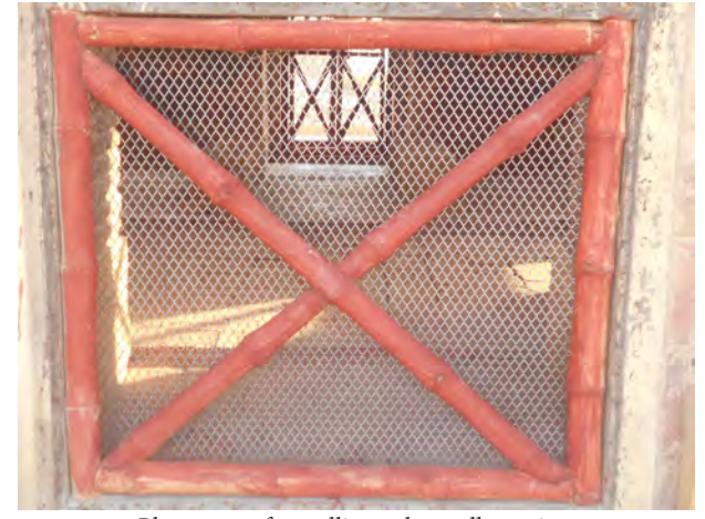
Placement of metallic mesh on all openings