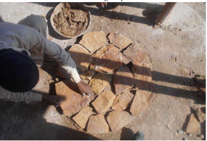
Stone flooring being prepared on Site