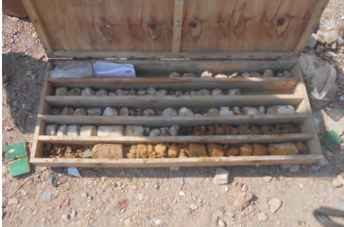
Core samples from geotechnical soil investigation