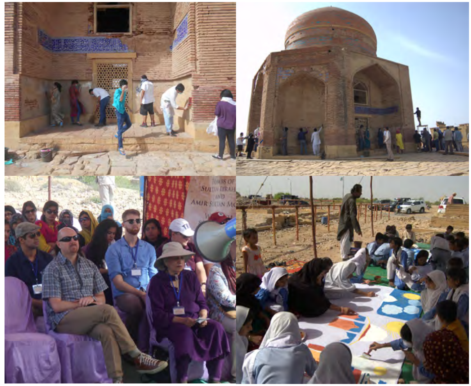
Heritage cleaning and heritage mural painting day at Tomb of Sultan Ibrahima & Amir Sultan