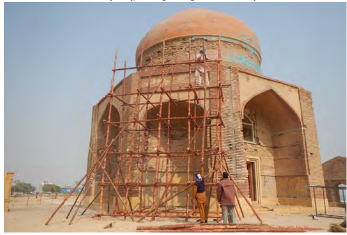
Erection of Bamboo Scaffolding along South-West Facade