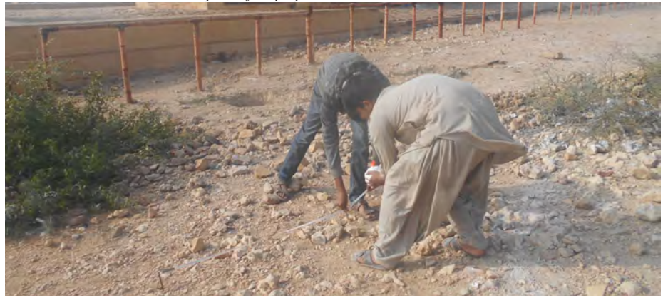
Work being undertaken for construction of display space at Sultan Ibrahim