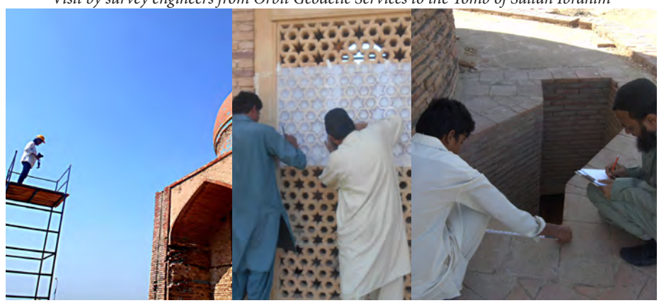
Heritage Foundation teams conduct studies at site