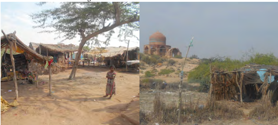
Community living along the river bed near the tomb of Sultan Ibrahim and Amir Sultan