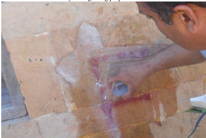
Cleaning graffiti that defaces the monument