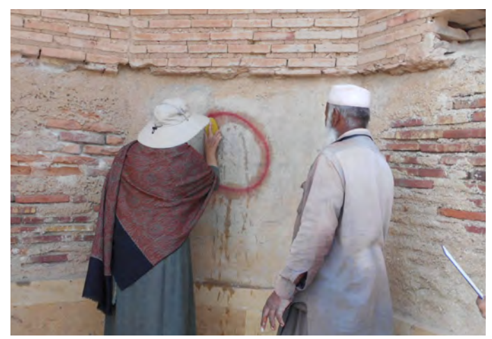
Cleaning being undertaken on Site

With the monuments being neglected for many years, the tombs have been defaced with various forms of graffiti, i.e.