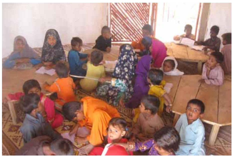
Children at Sukh Mul Literacy Centre