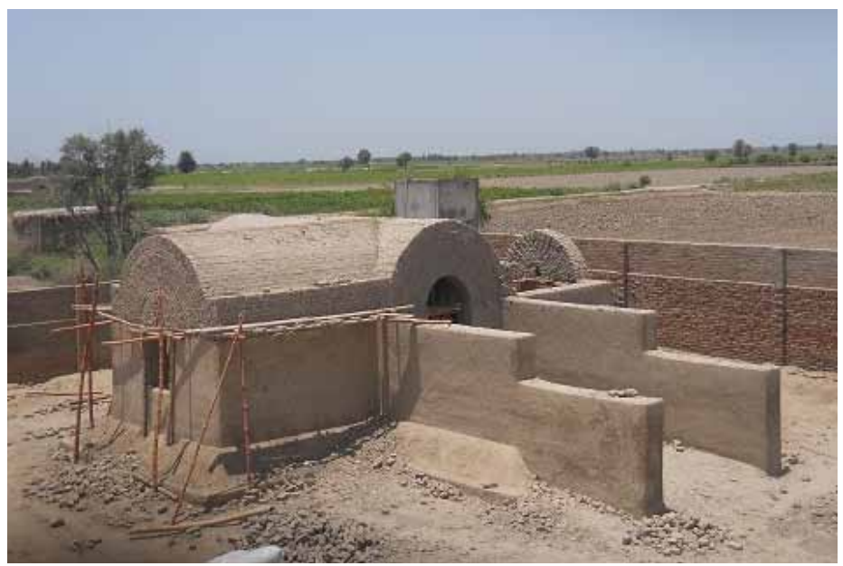
Khakoo Wassan Health Satellite Clinic under construction