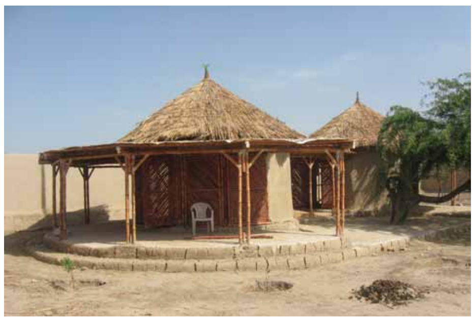
Women and Literacy Centre at Kakoo Wasan

The toilets of the school are nearing completion. Some other facilities and play area is still to be created.