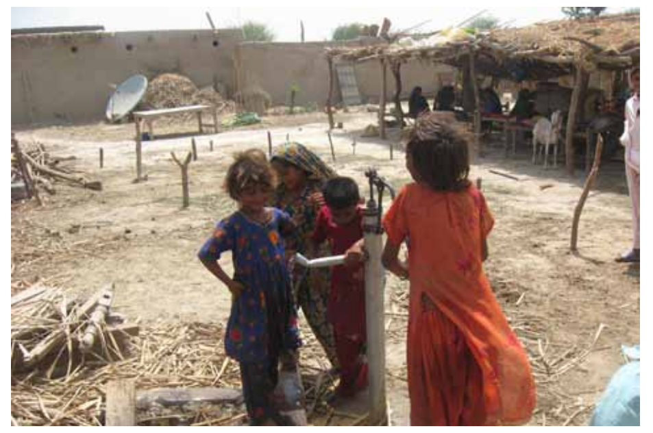
First hand pump installed in Khakoo Wasan