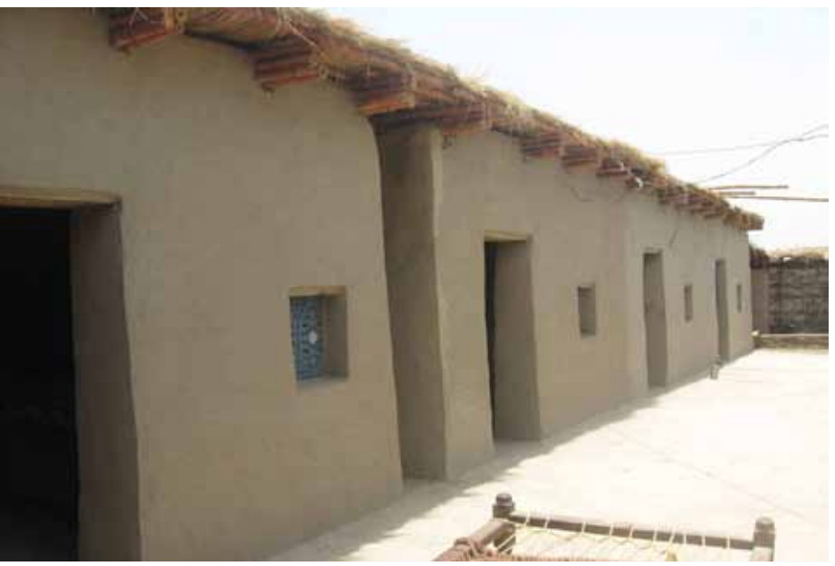
Joined shelter units