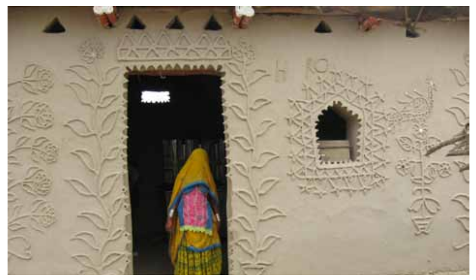
Beneficiary standing in her new house