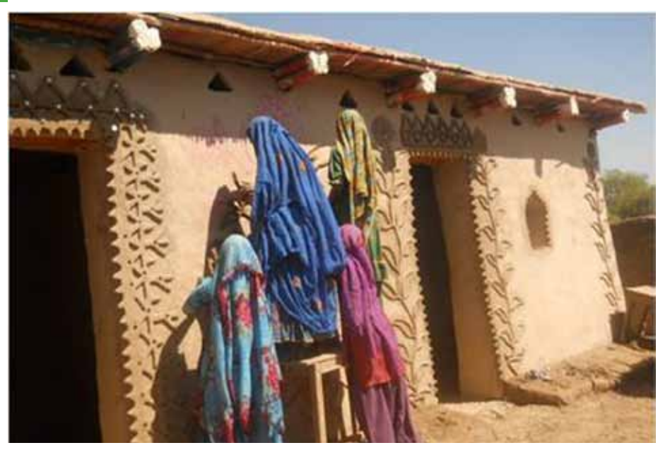
Decorating the new house with mud tracery

Since women have been deeply engaged in the process of building their walls and in plastering, their pride and ownership is evident in the beautifully decorated facades, some of which are shown in this report.