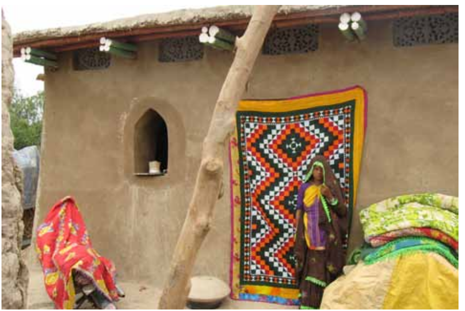
Completed Shelter unit with beneficiary