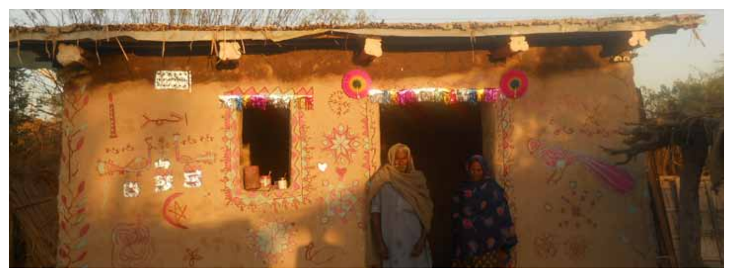
Beneficiary with their new shelter unit