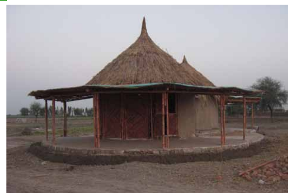
Sukh Mul Women and Literacy Centre