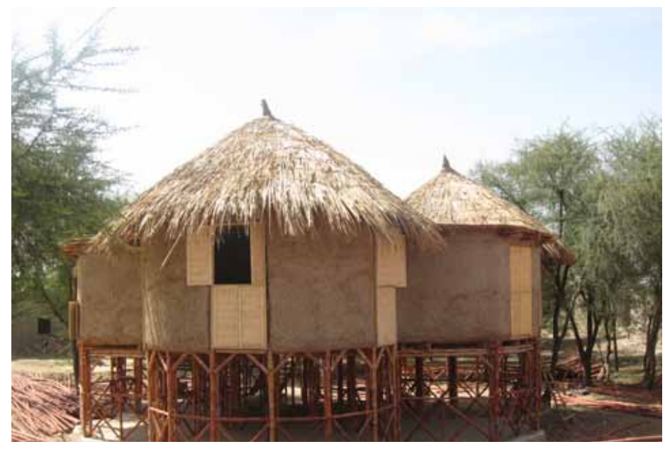
Primary School, Karim Dad Wasan