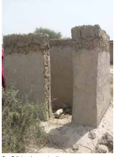
Eco Toilet under construction