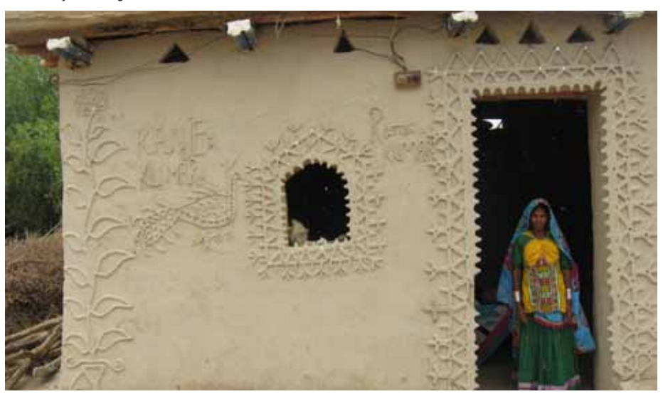
Beneficiary in her new house