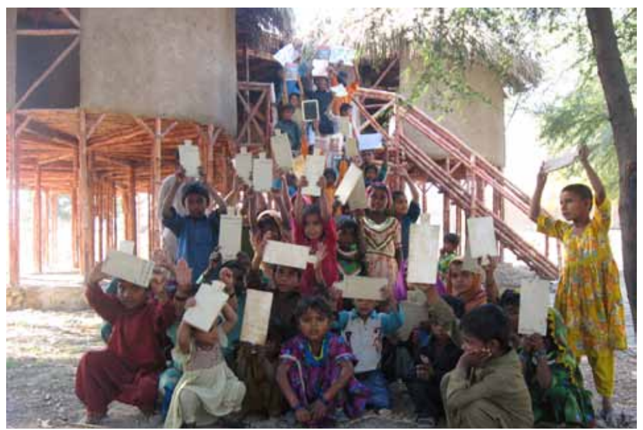
Students at Karim Dad Wassan Primary School