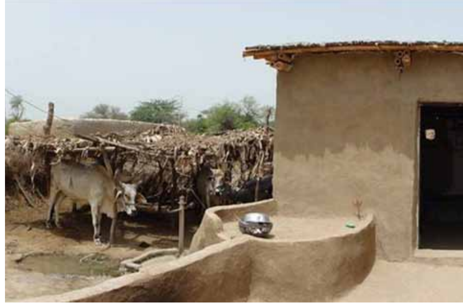
Separation of livestock