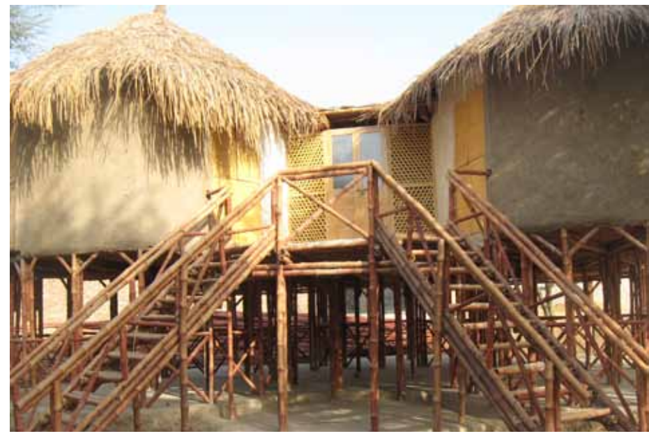
Primary School main entrance, Karim Dad Wasan