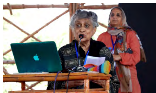
Architect Yasmeeen Lari, CEO HF, presenting details of World Heritage Makli.