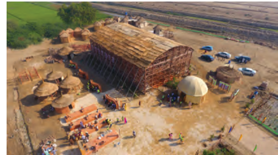
(Above). Aerial view of ZC3, venue of the Workshop.