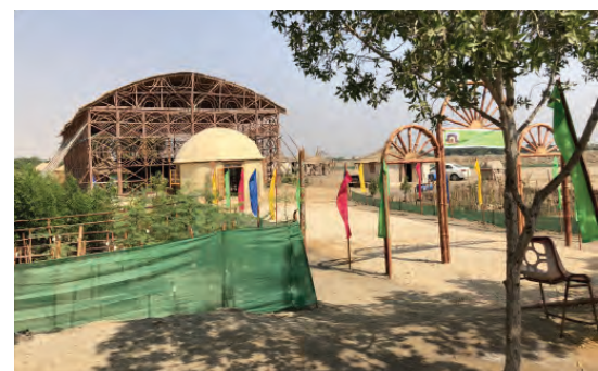
Entrance to ZC3, venue of the workshop.