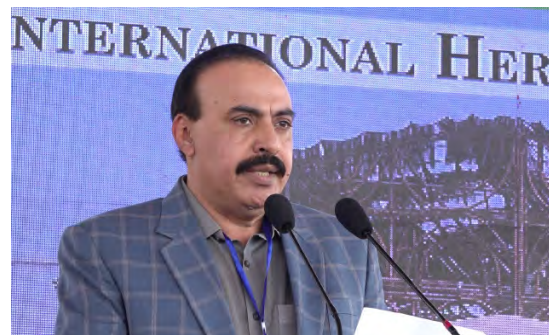
Director General Archaeology, GoS, presenting welcome speech..