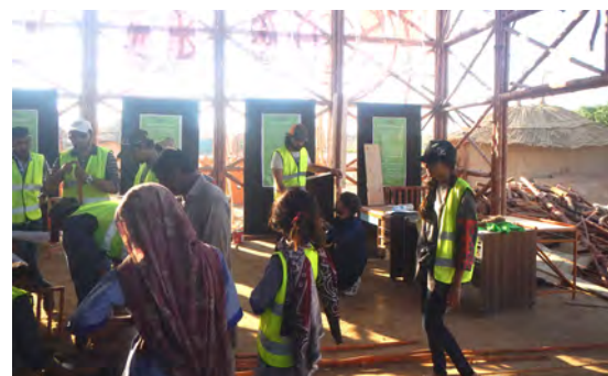
Students' workshop in progress.