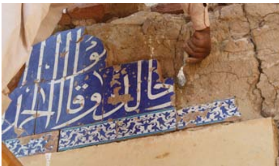
Stabilizing historic kashi with mud edging