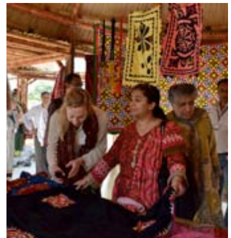
Consultative Committee Meeting - Day 1