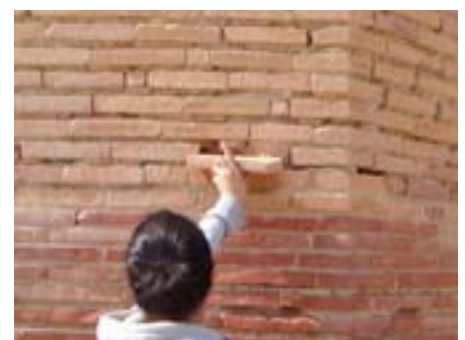
Matching burnt brick for underpinning