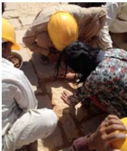
Pointing stone flooring demonstration