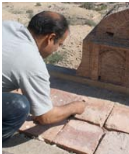
Investigation of roof top layers