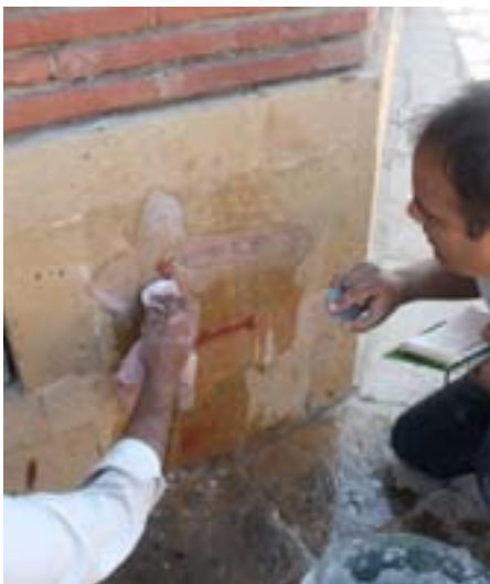
Sample for graffiti cleaning