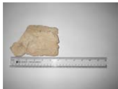
Historic samples for testing - Stucco