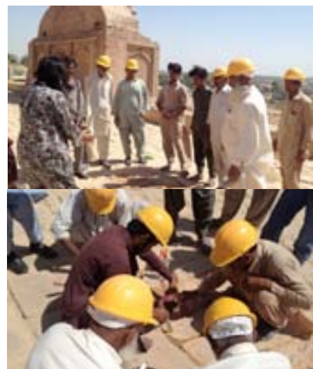
Explaining rationale and implementing samples

• Two gangs comprising of a master artisan and a young trainee began the pointing according to the schedule. Since the pointing is to be conducted with care using miniature tools, it is estimated that it may take over three months to complete.