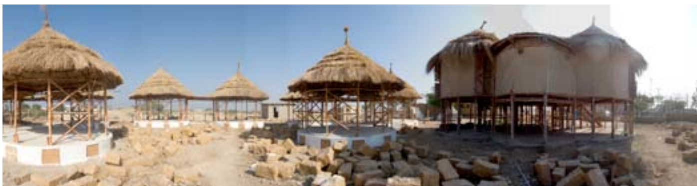
Artisan cluster nearing completion