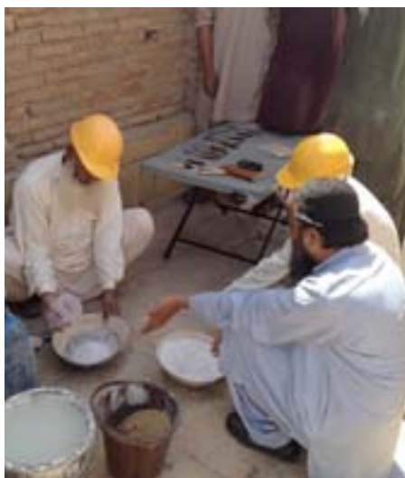
Measuring dry mix for mortar samples