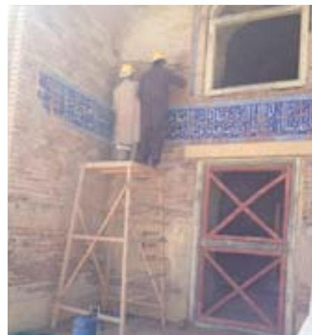
Pointing of historic bricks

• A schedule was issued to the site for implementation of pointing on the stone platform of the monuments as well as the alcoves and faces of the tomb of Sultan Ibrahim.