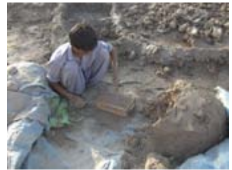
Fabrication of mud brick