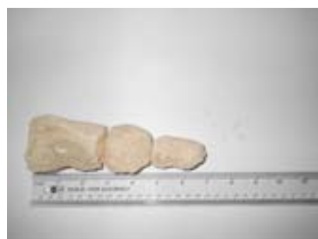
Historic samples for testing - External Mortar