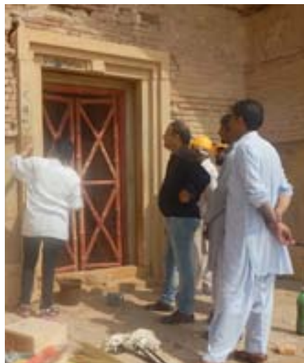
Wet cleaning demonstration