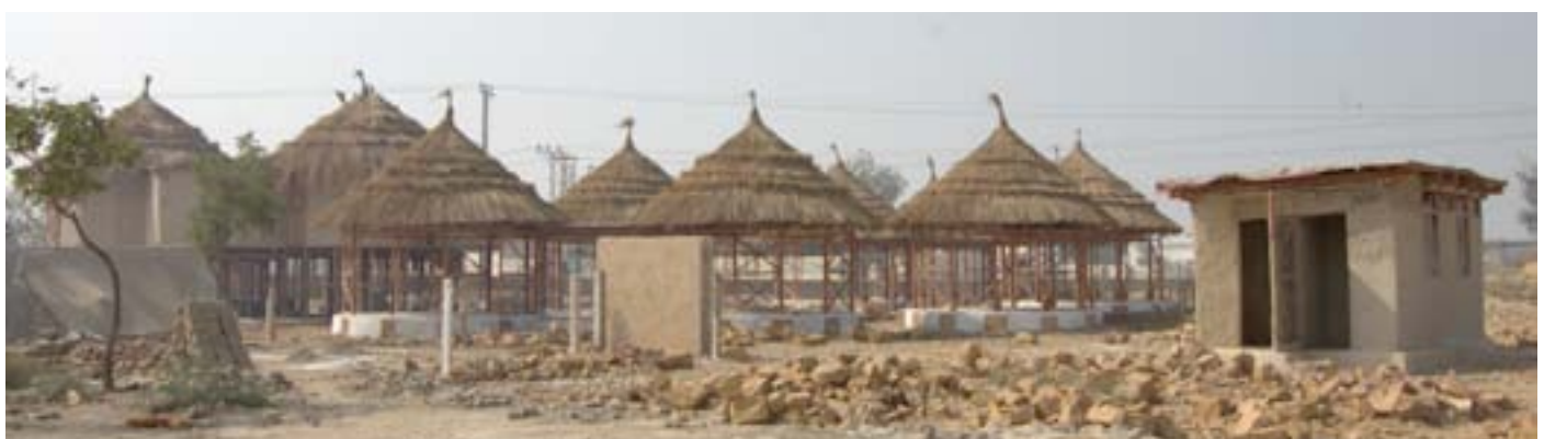
Completed Artisans' Ateliers and Heritage Laboratory (right_ nearing completion)