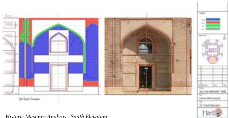
Historic Masonry Analysis - South Elevation