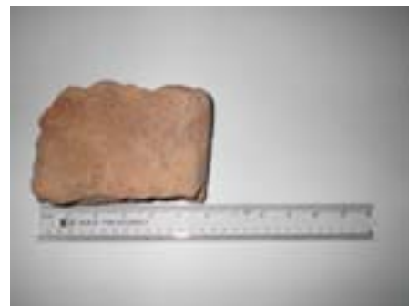
Historic samples for testing - Brick