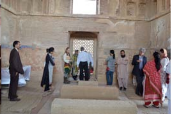
Consultative Committee Meeting - Day 1