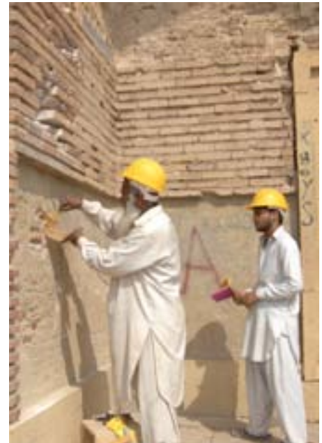
Dry cleaning of Monuments