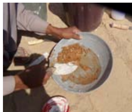
Daily mortar sample preparation