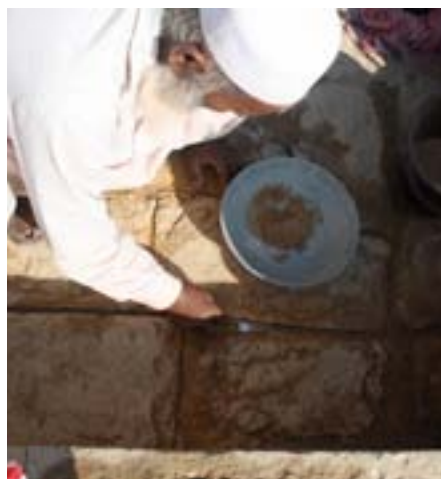
Mortar re-pointing in stone platform