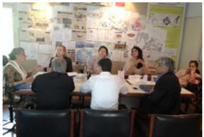
Consultative Committee Meeting - Day 2