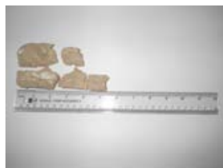
Historic samples for testing - Internal Mortar