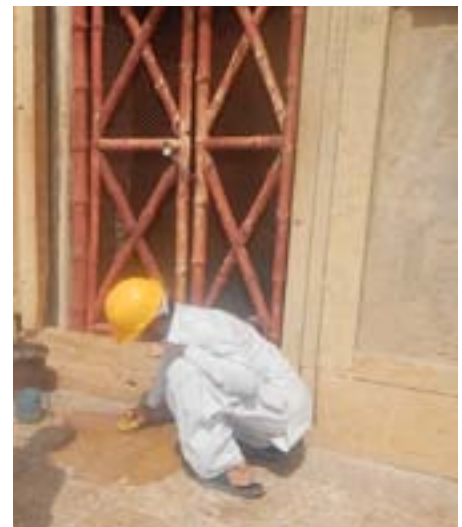
Wet cleaning of stone flooring