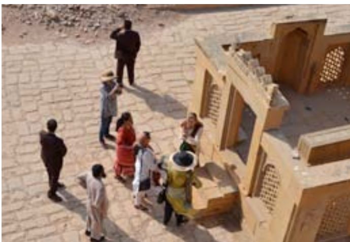
Consultative Committee Meeting - Day 1