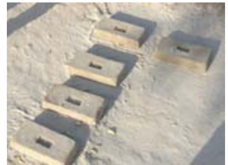
Samples of mud-brick for CC meeting