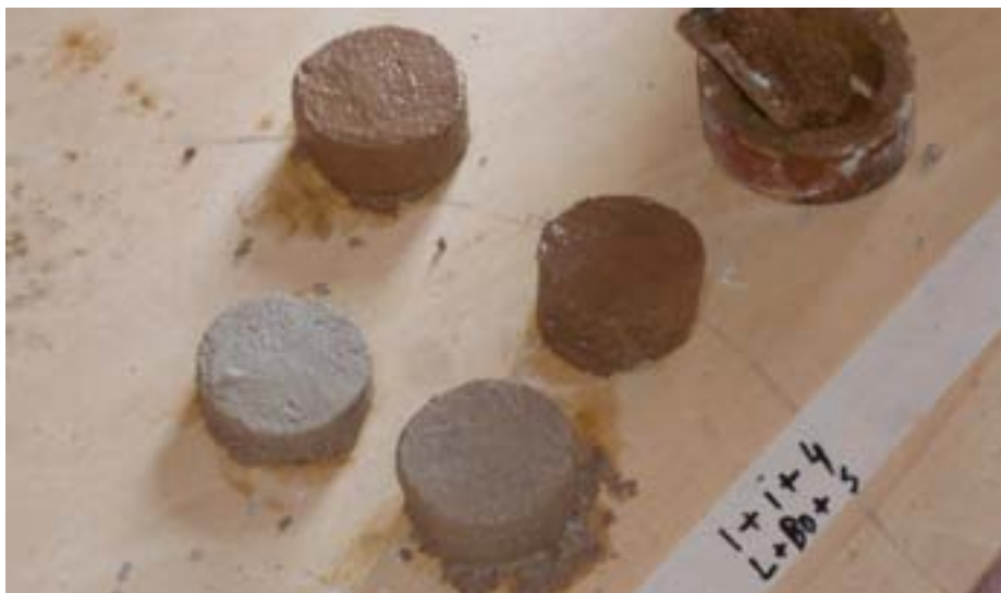
Various samples for matching mortar prepared