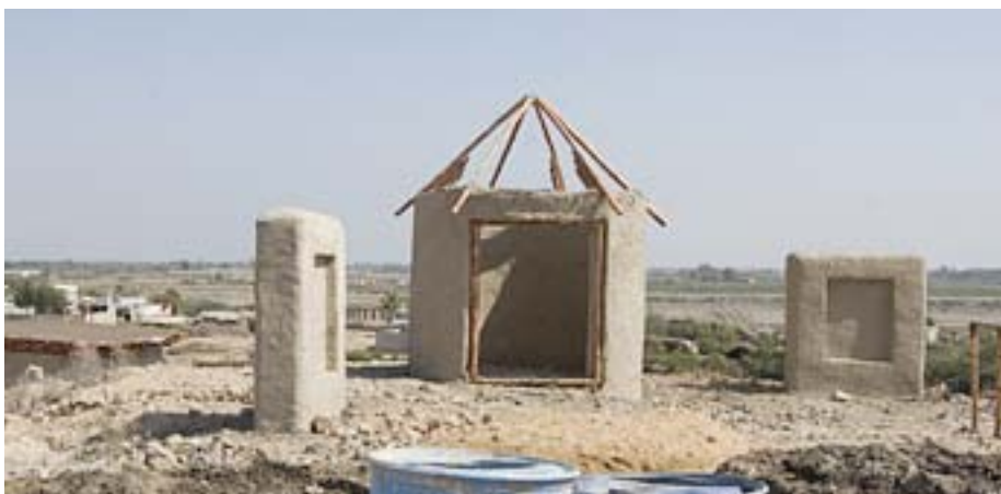
Presentation kiosk and display walls nearing completion