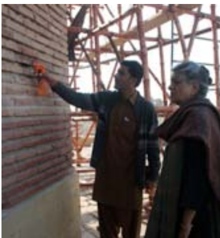
Mortar re-pointing in outer face