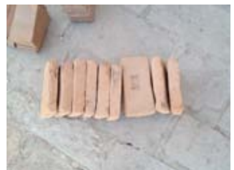
Matching burnt brick for underpinning