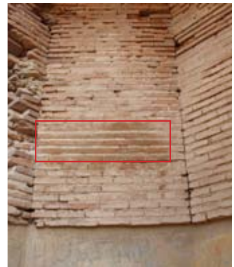
Mortar re-pointing sample in alcove