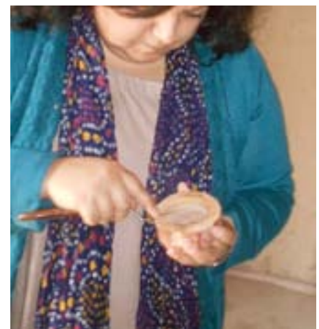
Method for preparing mortar samples