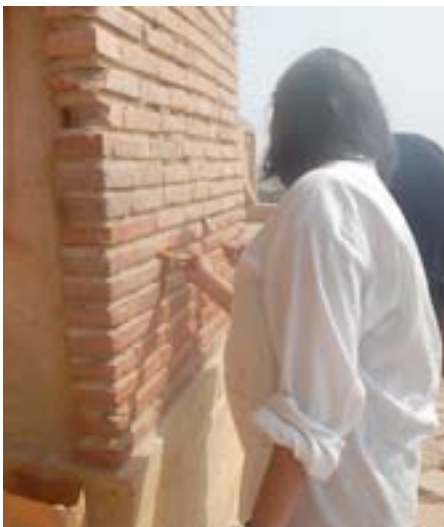
Dry cleaning of mortar joints