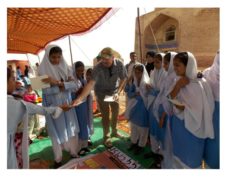
Certificate distribution by US Consul General.