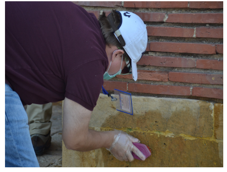
One of the members of the US Consulate General scrubbing off markings from the plinth of tomb of Sultan Ibrahim.