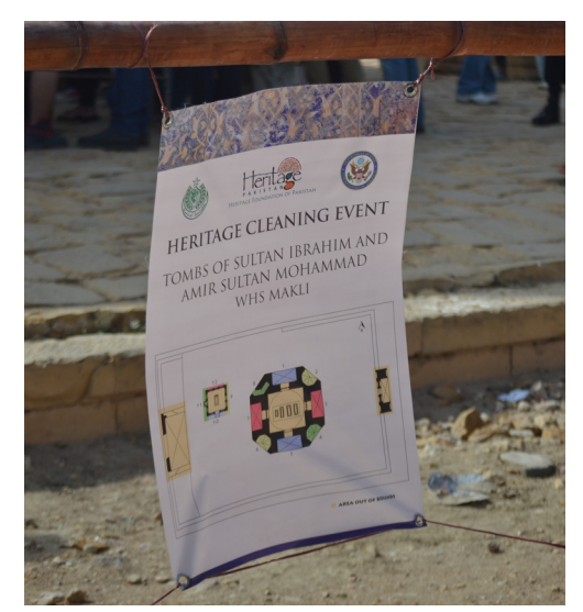
Key plan showing the distribution of groups around tombs of Sultan Ibrahim and Amir Sultan Mohammad for cleaning.