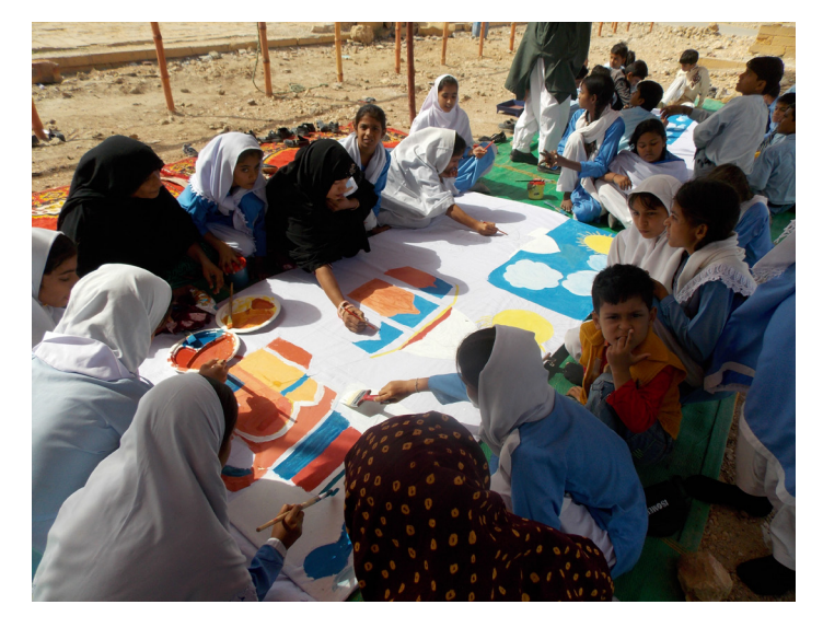
School students painting murals.