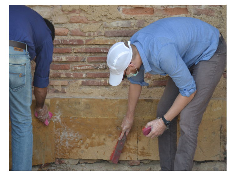
Members of the US Consulate General taking part in the cleaning exercise.