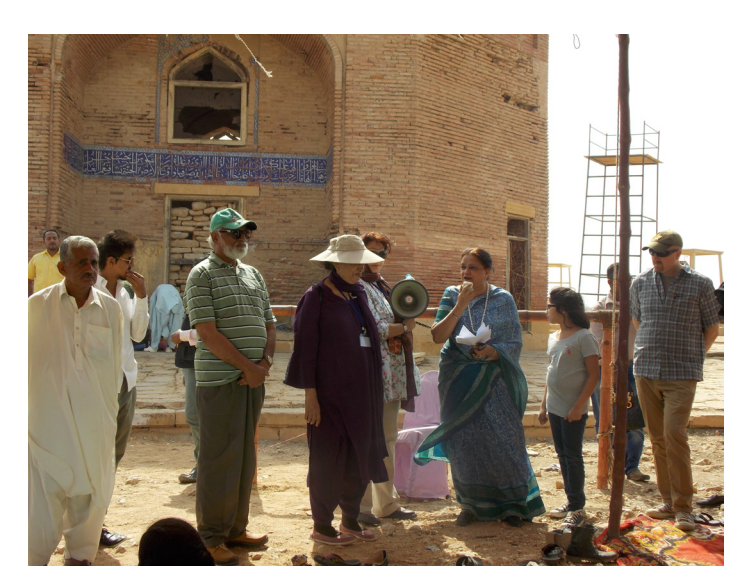
Concluding remarks by Senator, Nasreen Jalil.