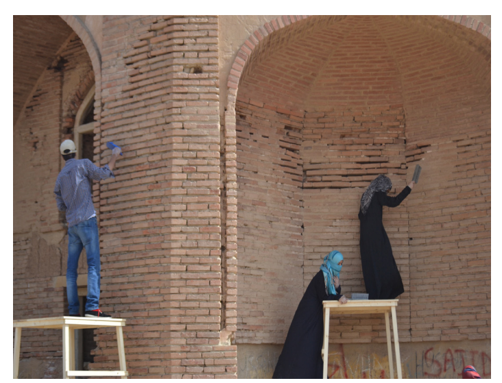
Students taking part in the cleaning activity.