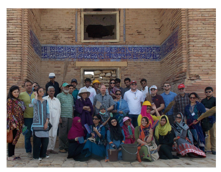
A Group photo of volunteers with respective guests and hosts of the event.