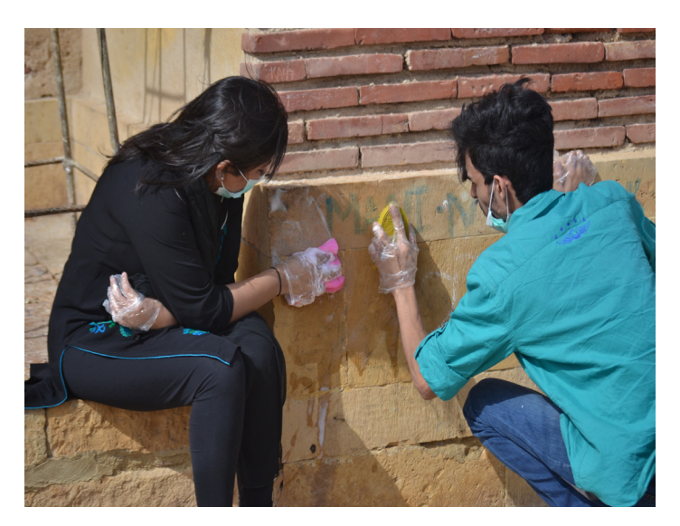
Students scrubbing off graffiti from stone plinth.