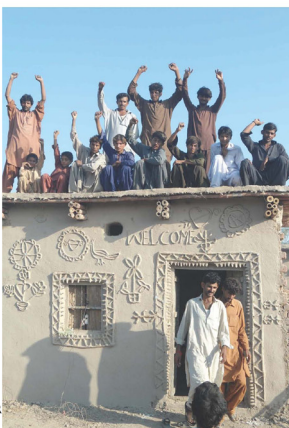
Typical One Room Shelter (ORS) KaravanGhar (Karavan House)

LIME PLASTER RENDERING FOR WEATHER RESISTANCE